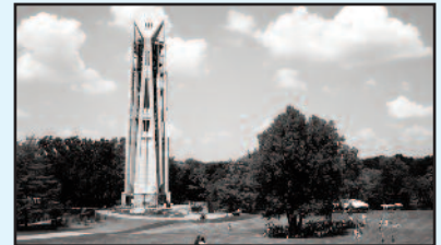
Millennium Carillon in Moser Tower