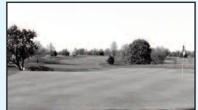
Springbrook Golf Course