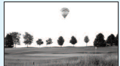
Naperbrook Golf Course